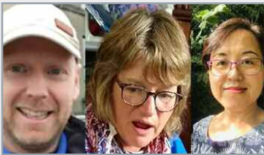
P2: New staff