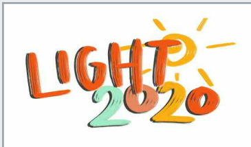
P5: Calling Team Members