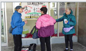
P6: Gathered In mission