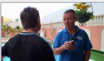
P8: Tenerife mission