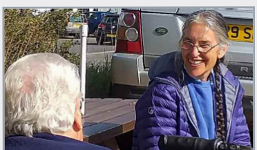
P4: Wiggenhall St Germans