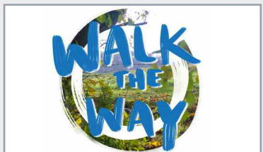
P3: Walk the Way