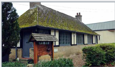
P2: The Office