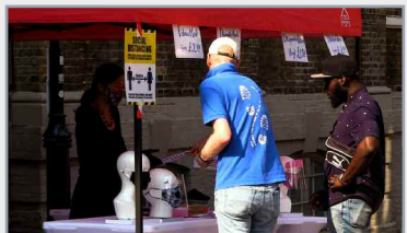
P3: Ministering in Covid-19