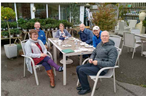
below: Tea and cake to say thank you