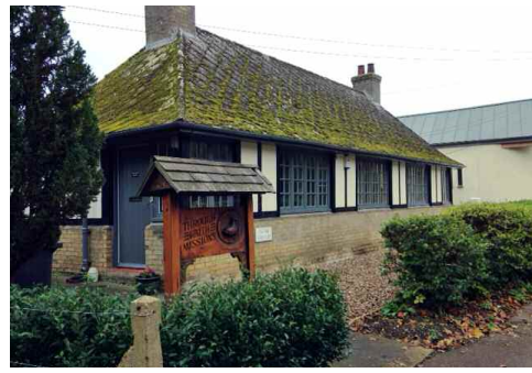
Pictured above: The Office

On the one hand, I wonder why we worry about this as God continues to provide for all our needs. Indeed, we have not seen any fall in income through this year, something we know has been a problem for many ministries. On the other hand, we know that we cannot be complacent. So again, we ask you to pray with us that we will continue to walk in His service and that He will provide to cover the work. A move to new premises will, of course, cost us more!