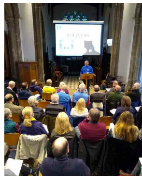
Huntingdon training in January (pre-lockdown)

It's not been easy – TFM has become adept at learning and adapting at short notice – and the outlook remains 'uncertain, at times arduous'. So I am